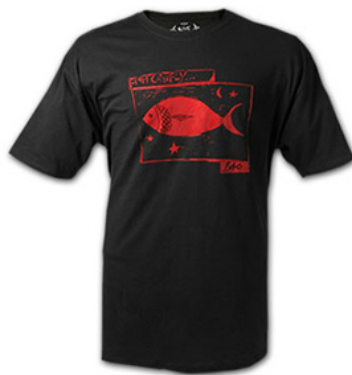
The 'Fish Can Fly' t-shirt

Made from African cotton and designed by Bono, the shirts feature a fish soaring through the moon and stars. They are available from the Hard Rock Cafe website: www.hardrock.com .