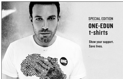
Actor Ben Affleck models a ONE t-shirt

Rock star activist Bono has launched two new special edition t-shirts, manufactured in Lesotho, to deliver his anti-poverty message around the world.