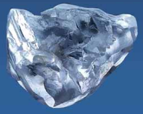
Letseng Legacy 493 C.T.