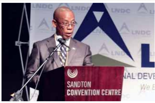
Hon Sekhulumi Ntsoale - Lesotho Minister of Trade and Industry, Cooperatives and Marketing