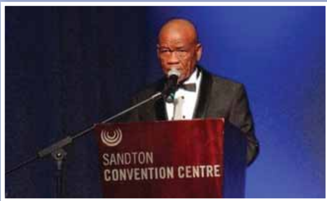
Road Show Launch by The Rt. Hon the Prime Minister