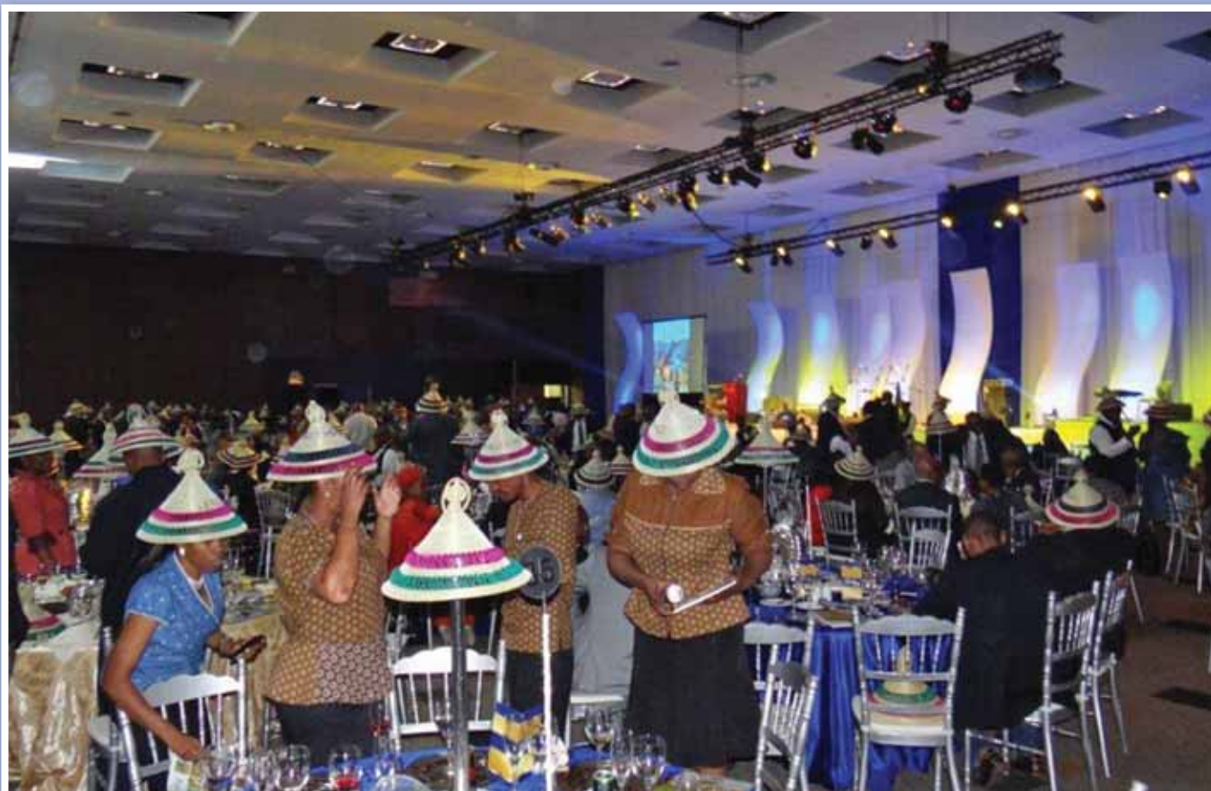
Road Show Launch LNDC Branding the Nation