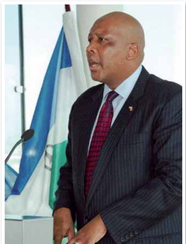
His Majesty King Letsie III

With the trend of challenges facing the nation, and the desire to respond to the development aspect of the Corporation's Mission, LNDC continues to fully engage in Corporate Social Investment. As part of the efforts to raise funds for the extension and refurbishment of Scott Hospital; the birth place of the Monarch, in celebration of the 50th birthday anniversary of His Majesty King Letsie III, LNDC together with Metropolitan Lesotho, Standard Lesotho Bank and Letšeng Diamonds hosted a Jazz concert by NNENNA FREELON in December. Phase one of the project estimated at M15 million, covers the following components: 24 bed ward Maternity Ward, 10 bed Labour Ward including, 6 Cot Nursery Units, 4 bed Lactating Mothers, 1 Feeding room, 18 bed General Female Ward, 12 bed TB Female Ward, 4 bed MDR Rooms, Associated and support facilities.