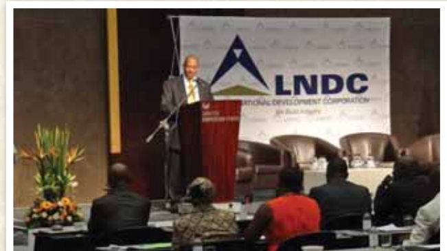
PS - MTICM addresses the Business Forum in Johannesburg