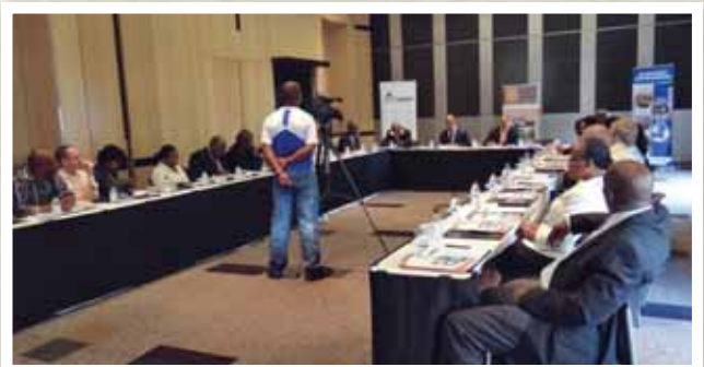
Roundtable with Donors and Development Partners