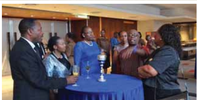
Members of the Executive Committee