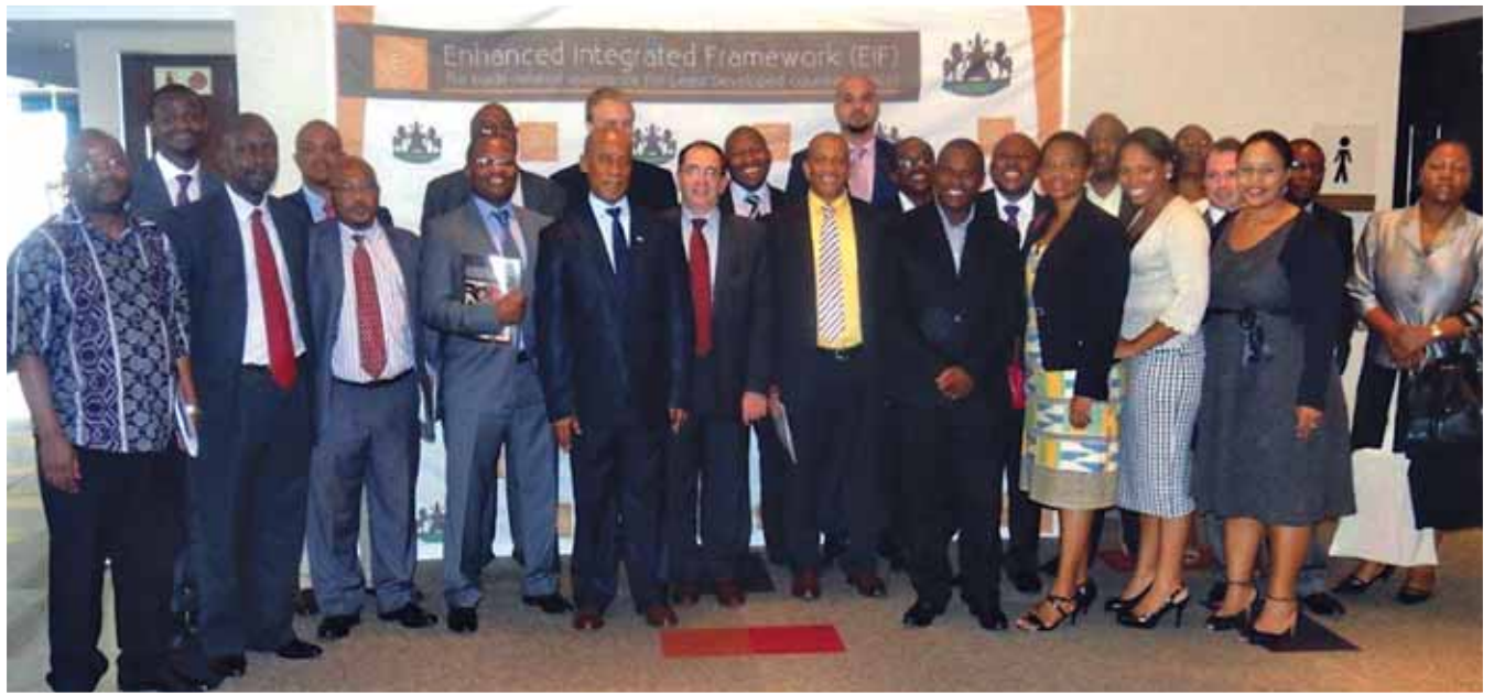
Enhanced Integrated Framework hosts a roundtable with Donors and Development Partners