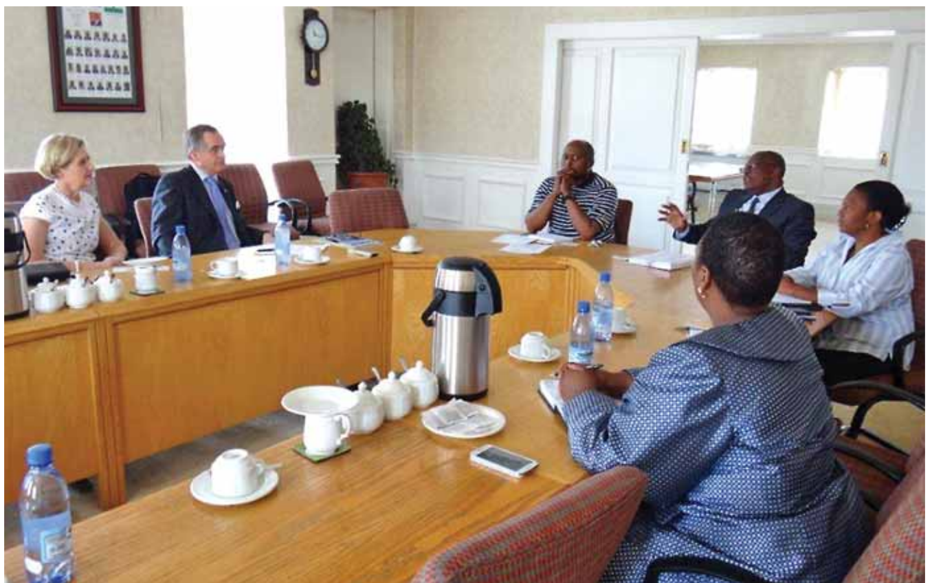
Finnish Honorary Consul visits LNDC

The Finnish economy has reportedly diversified, with expansion into fields such as electronics (e.g. Nokia), metrology, transport fuels, chemicals, engineering consulting, and information technology and is no longer dominated by the two sectors of metal and forest industry.