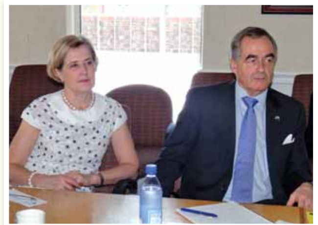
Finnish Honorary Consul and Spouse

Finland rapidly industrialized after the Second World War, achieving GDP per capita levels equal to that of Japan or the UK in the beginning of 1970s. Initially, most development was based on two broad groups of export-led industries, the "metal industry" and "forest industry".