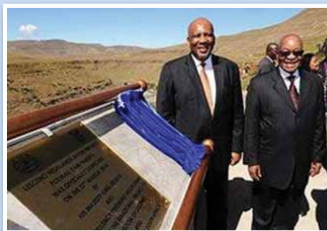
His Majesty King Letsie III and President Zuma Launch the Highlands Water Project Phase 2

LNDC continues to encourage entrepreneurs to interrogate and scrutinise thoroughly, all benefits that come with the ambitious project; seek advice and assistance where there is need. Below, is an inconclusive list of Opportunities of the Polihali Dam Project.