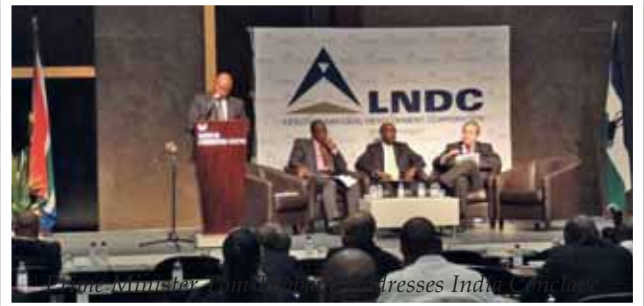
LNDC CCEO, LTDC CEO and PBF representative addressing the Business Forum