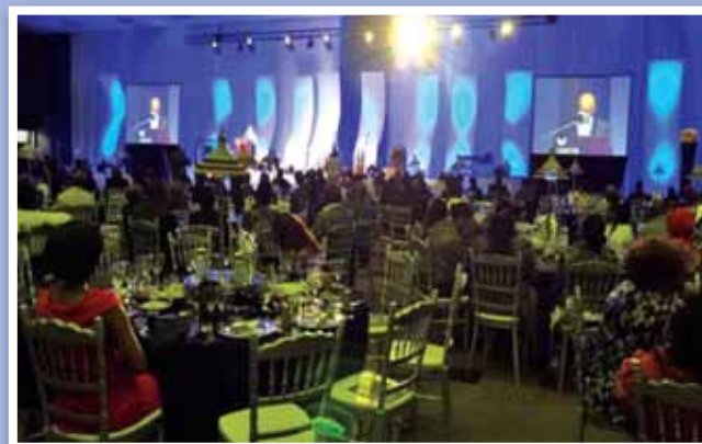
Road Show Launch by The Rt. Hon the Prime Minister Dr. Motsoahae Thomas Thabane