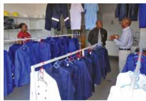
Johane Garments Retail Shop