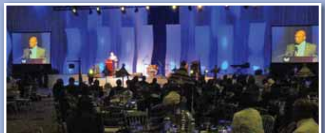
Road Show Launch Minister of Development Planning - Dr. Moeketsi Majoro

Full coverage of this event is on Lesotho National Development Corporation Social Media Channels of You Tube, Flickr and Facebook.