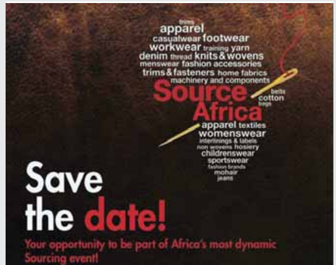
Source Africa Logo