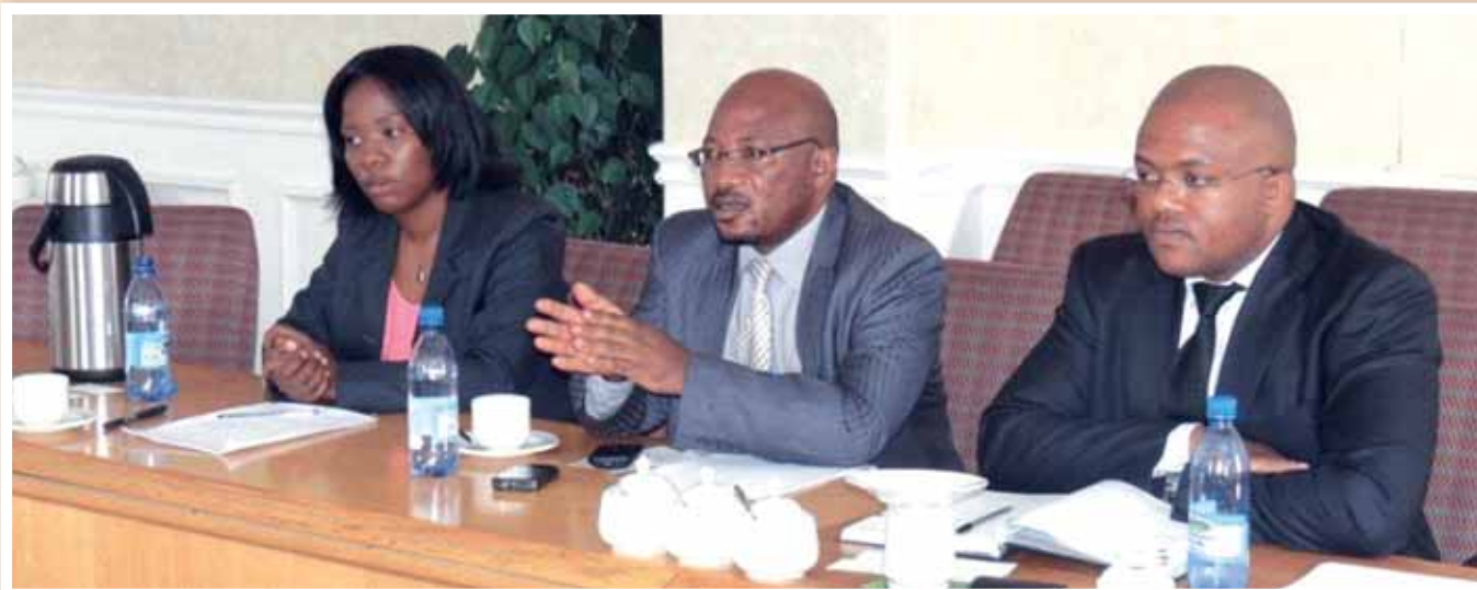
China Africa Development Fund hosted by LNDC Head of Planning, Research and Information Management and Investment Promotion Managers