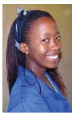
Johane Garments Intern from Limkokwing University of Creative Technology

Johane Garments; a small but fast growing operation by five young Basotho graduates of the National University of Lesotho as well as the Limkokwing University of Creative Technology was established by a diverse group of male and female entrepreneurs who studied Fashion and Apparel Design, Business Administration and Information Technology.