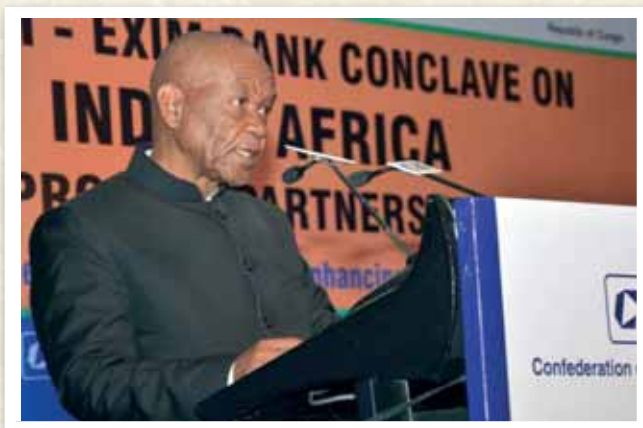
Prime Minister Tom Thabane Addresses India Conclave

The Lesotho National Development Corporation participated in the 10th CII-EXIM Bank Conclave on India Africa Project Partnership. Lesotho's Prime Minister the Right Honourable Dr. Motsoahae Thomas Thabane addressed the inaugural session of the Conclave in New Delhi on the 9th, March 2014, with the theme 'Accelerating Economic Growth through Innovation, Transformation, Inclusion and Governance'