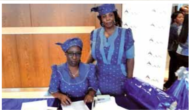
LNDC Personal Assistants