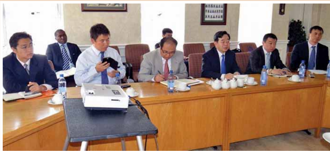
China Africa Development Fund hosted by LNDC