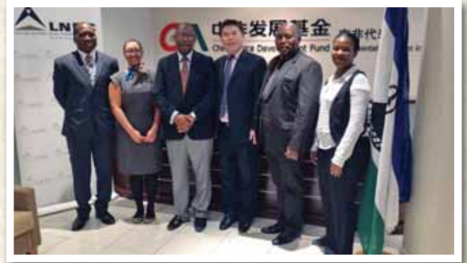
CAD FUND & LNDC enter into Partnership