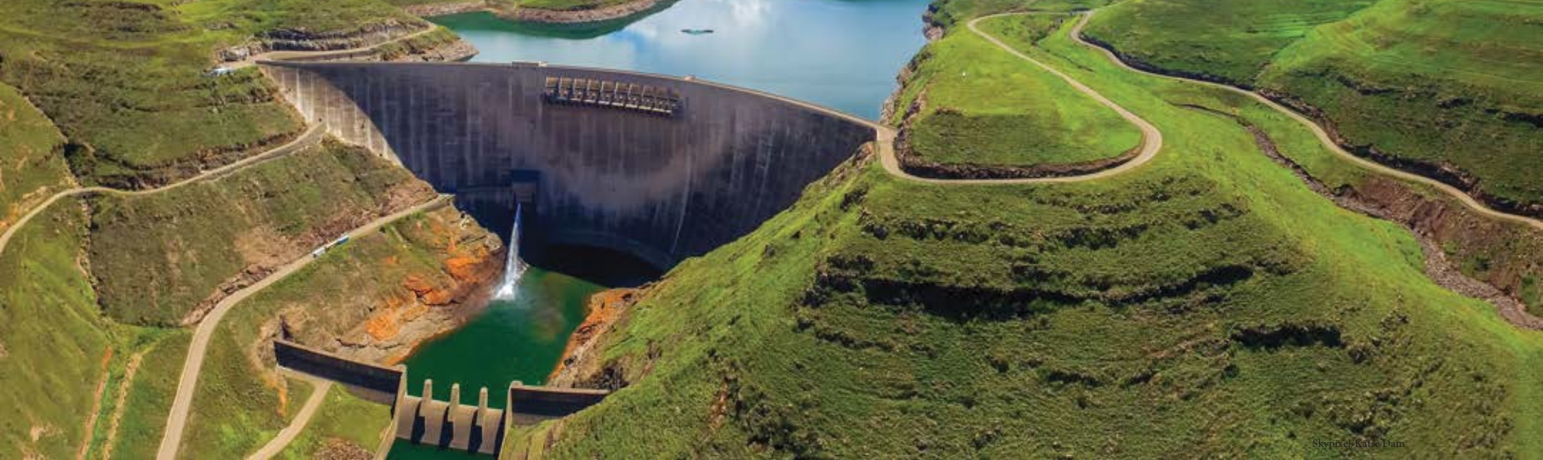
Skyrock Falls Dam